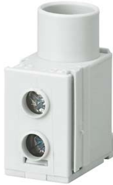
Center infeed terminal 50mm 2 for pin busbars according to UL 508