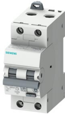
RCBO, 10 kA, 2P Type A, 30 mA, C-Char, In: 25A Un: 230V