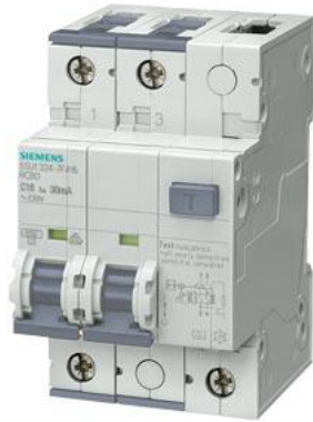
RCBO, Icn: 10 kA, 2P, type A, 30 mA, C-Char, In: 6 A, Un AC: 110 V