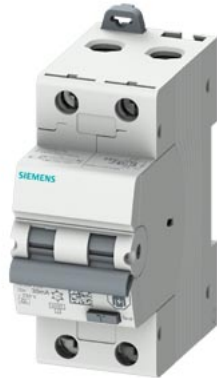
RCBO, 6 kA, 2P Type A, 30 mA, C-Char, In: 10A Un: 230V