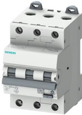
RCBO, 6 kA, 3P Type A, 300mA, B-Char, In: 6A Un: 400V