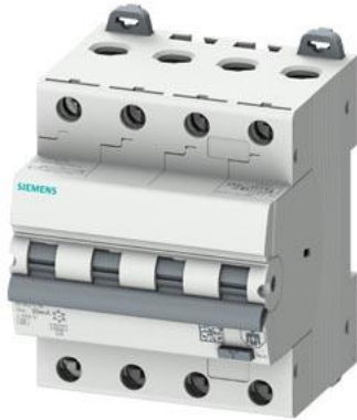
RCBO, 6 kA, 4P Type A, 300mA, B-Char, In: 16A Un: 400V