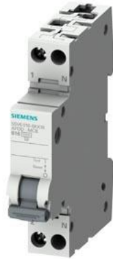
AFDD-MCB-Combination 230V, 6kA, 1+N, C, 16A Compact (1MW)