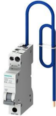
AFDD-MCB-combination 230V, 6kA, 1+N, C, 6A compact (1MW) pigtail