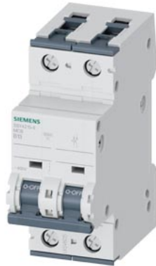
Miniature circuit breaker 400 V 10kA, 2-pole, B, 13 A, D=70 mm