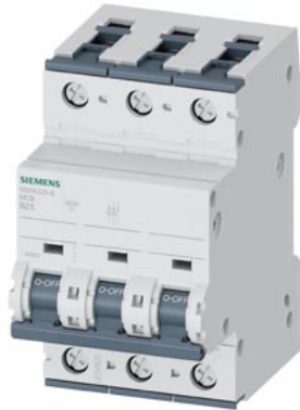
Miniature circuit breaker 400 V 10kA, 3-pole, B, 25A, D=70 mm