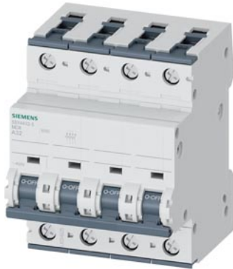
Miniature circuit breaker 400 V 10kA, 4-pole, A, 32 A, D=70 mm