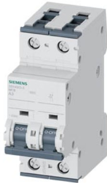
Miniature circuit breaker 230 V 10kA, 1+N-pole, A, 3 A, D=70 mm