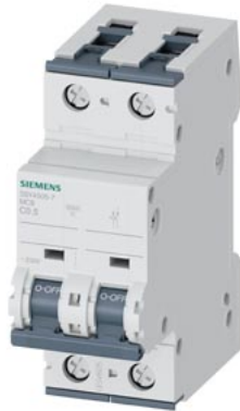
Miniature circuit breaker 230 V 10kA, 1+N-pole, C, 0.5A, D=70 mm