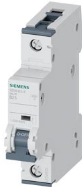
Miniature circuit breaker 230/400 V 6kA, 1-pole, B, 25A, D=70 mm