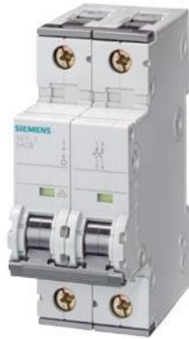
Miniature circuit breaker 230 V 15kA, 1+N-pole, B, 16A, D=70 mm