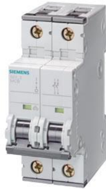
Miniature circuit breaker 230 V 15kA, 1+N-pole, C, 20 A, D=70 mm