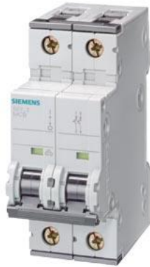
Miniature circuit breaker 230 V 15kA, 1+N-pole, B, 32 A, D=70 mm