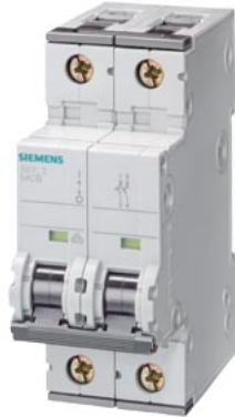
Miniature circuit breaker 400 V D=70 mm 25 kA according to EN 60947-2, 2P, D8