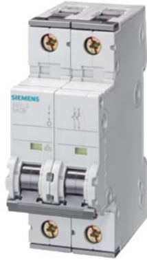
Miniature circuit breaker 400 V D=70 mm 25 kA according to EN 60947-2, 2P, C13