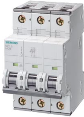
Miniature circuit breaker 400 V D=70 mm 25 kA according to EN 60947-2, 3P, D0.5