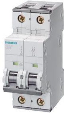
Miniature circuit breaker 230 V D=70 mm 25 kA according to EN 60947-2, 1P+N, C0.5