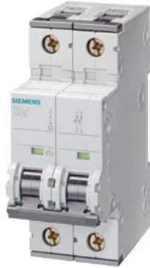
Miniature circuit breaker 230 V D=70 mm 25 kA according to EN 60947-2, 1P+N, C10