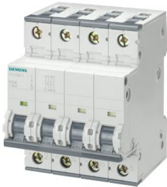
DC isolators 1000 V DC, 63A