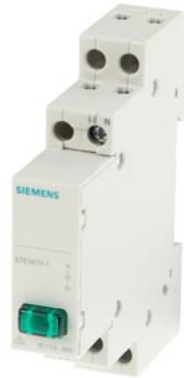
Light Indicator 1x LED 12..60V green