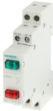
Light Indicators 2x LED 12..60V red / green