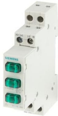
Light Indicators 3x LED 12..60V green