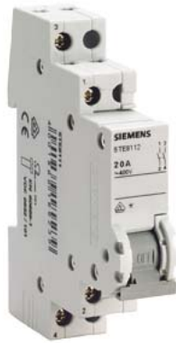
switch disconnecter, on-off switch 20 A 2 NO