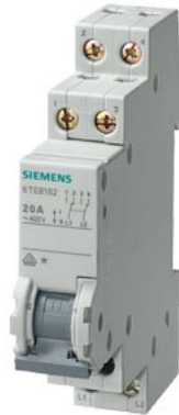
Two-way switch 20 A 2 CO