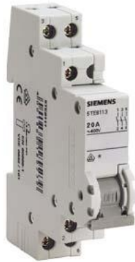
switch disconnecter, on-off switch 32 A 3 NO terminal 6 mm 2