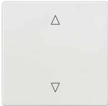
I-System Rocker with up and down symbol Titan white