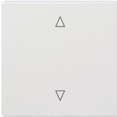
Delta Style Rocker with up and down symbol Titan white