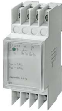
Voltage relay T5570 AC 230/400V 2W 0.7/0.9 Asymmetry with transparent cap