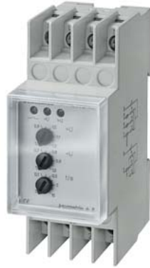
Voltage relays AC 230/400V 2CO 0.9/1.3+0.7/1.1 With transparent cap