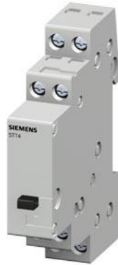
switching relay with 2 CO contact for 230V AC 16A control 230V AC