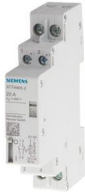
Remote control switch Contact for 20 A Voltage 24 V AC 2 NO