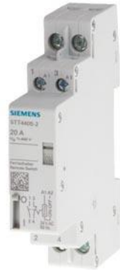
Remote control switch Contact for 20 A Voltage 24 V AC 1 change-over contact