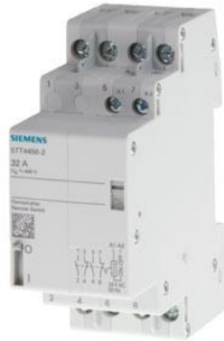
Remote control switch Contact for 32 A Voltage 24 V AC 4 NO contacts