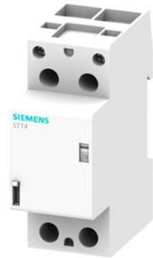
Remote control switch Contact for 40 A Voltage 230 V AC 1 NO 1 NC