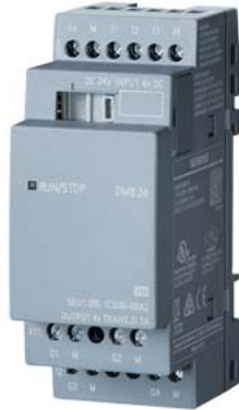
LOGO! DM8 24 expansion module, PS/I/O: 24V/24V/trans., 4 DI/4 DO for LOGO! 8