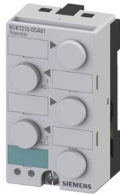
SIMATIC NET, Repeater for AS-Interface for cable extension in K45 enclosure