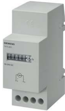
mechanical pulse counter 24 VDC